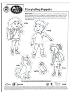
Molly of Denali Storytelling Puppets

Go for a walk and choose one item. Talk about why you chose it.