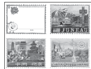
Let's Go Luna! Postcards